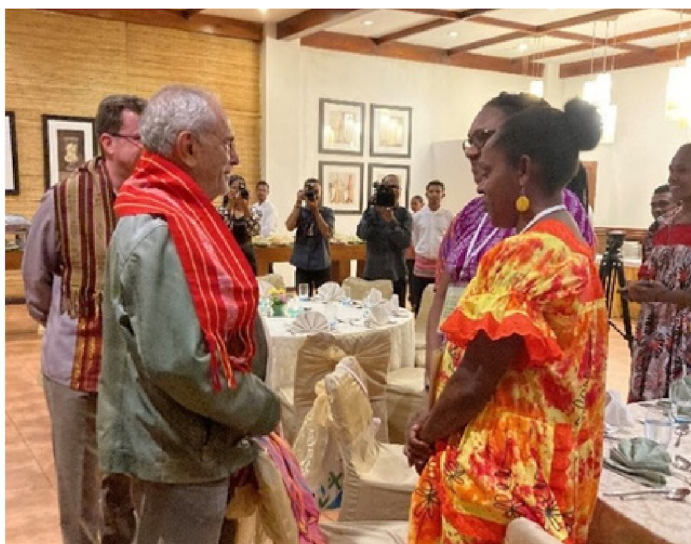
Attendees at CVA Regional Conference Meeting

The Timor Leste Veterinary Medical Association, in conjunction with CVA, hosted an international conference with a focus on animal health, epidemiology and laboratory diagnosis. Other major supporters were the Department of Foreign Affairs and Trade (DFAT), Australia and the Crawford Fund. The conference program ran for two days (Tues and Wed 14 -15 March 2023), followed by a workshop program on Thursday 15 March. The conference dinner was attended by His Excellency and Nobel Peace Laureate, Mr Jose Ramos Horta, other government staff and the Ambassador from Australia. CVA member countries and other groups in attendance included Timor Leste, Australia, Papua New Guinea, Samoa, Solomon Islands, Vanuatu, Fiji, SPC and FAVA.