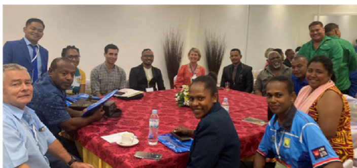
His Excellency Mr Jose Ramos Horta meeting Pacific Islands colleagues

The Timor Leste Veterinary Medical Association, in conjunction with CVA, hosted an international conference with a focus on animal health, epidemiology and laboratory diagnosis. Other major supporters were the Department of Foreign Affairs and Trade (DFAT), Australia and the Crawford Fund. The conference program ran for two days (Tues and Wed 14 -15 March 2023), followed by a workshop program on Thursday 15 March. The conference dinner was attended by His Excellency and Nobel Peace Laureate, Mr Jose Ramos Horta, other government staff and the Ambassador from Australia. CVA member countries and other groups in attendance included Timor Leste, Australia, Papua New Guinea, Samoa, Solomon Islands, Vanuatu, Fiji, SPC and FAVA.