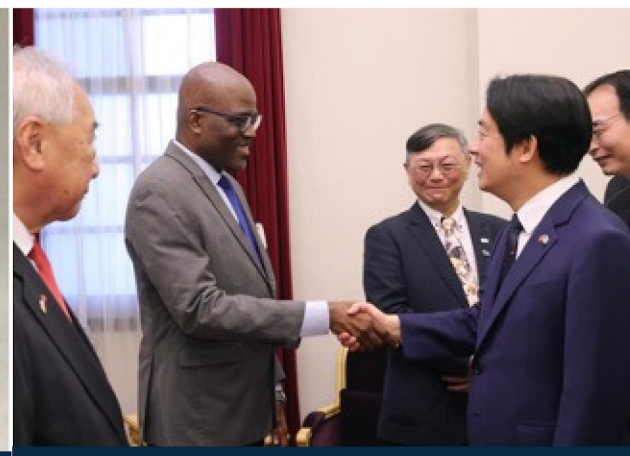
THE CVA PRESIDENT WITH THE TAIWANESE VICE PRESIDENT