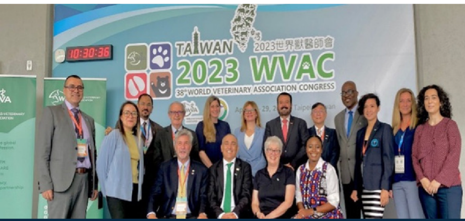
THE CVA PARTICIPATING IN THE WVA COUNCIL