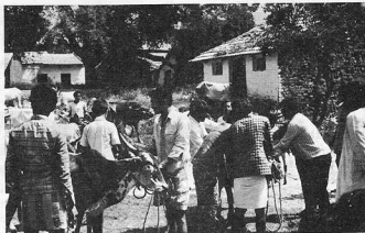
Animals being brought to the Health Camp.