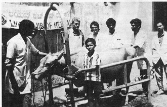
Pregnancy Diagnosis in a Crossbred Cow.

Women formed a large percentage of villagers who attended the camp. Health check and vaccinations being done.